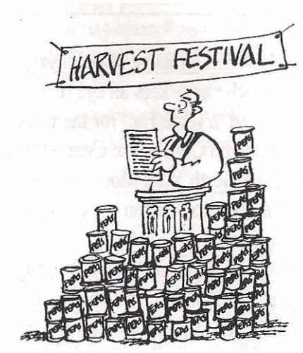
.I take it our local supermarket has a rather good offer on tinned peas at the moment!