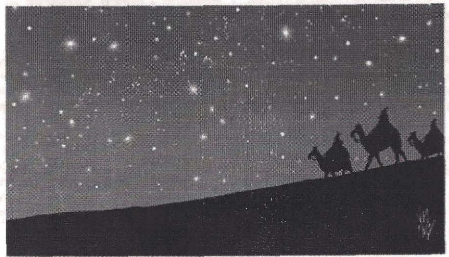
"Which star was it again?"

In addition beginning on New Year's Day there will be a service of Holy Communion every Wednesday at 10.00 in St Bartholomew's, Aldbrough