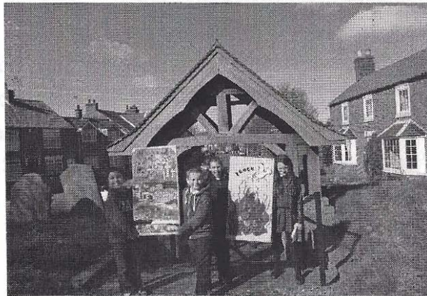
The children bringing their new banners to Aldbrough Church

Water freely with patience and cultivate with love